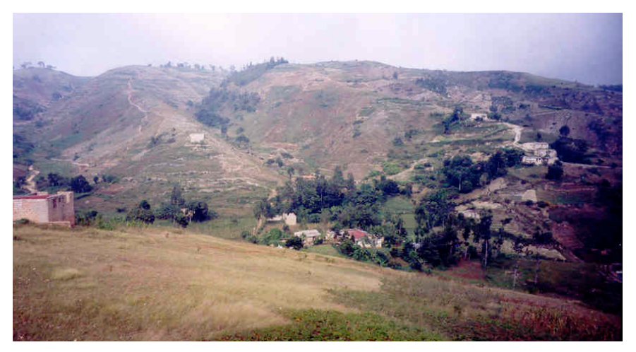
Countryside near Port-au-Prince

In a real sense those street vendors, and the ever present beggars, and even those guys gambling around the hulk of a cannibalized car were all, in a sense, entrepreneurs without much opportunity to realize a dream, even a modest one. The business of the day was simply to survive: no Starbucks in these neighborhoods. Someone said that Haitians are criticized for lack of long term vision: there seems just cause for such lack of looking ahead, at least long term – for the poor, tomorrow is the critical day, not five years down the road. The poor don't have the option of having dreams.