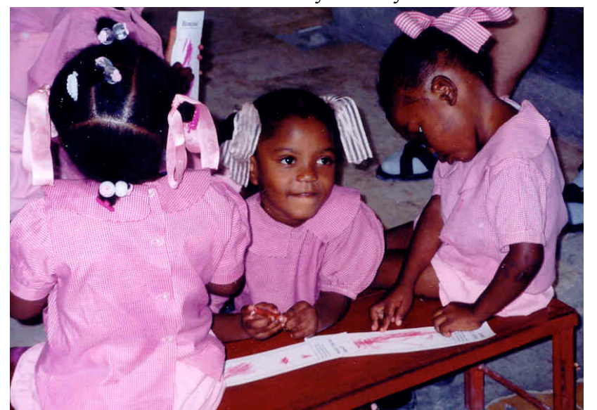
Children at SOPUDEP School

The final two days of our visit to Port-au-Prince were marked by political violence: antigovernment demonstrations, ultimately resulting, we were told, in several deaths. One of the deaths was a man we had met only two days earlier at a school which he had co-founded for 350